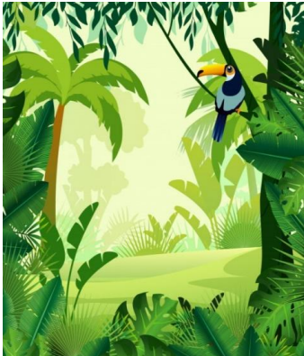
Figure 2. Sample Picture for Brainstorming with Students

From the picture above, Teacher explains that Allah SWT is the God of the universe, the God who created all life in this universe. Allah SWT also created human beings to worship Him. So, a Muslim must believe in the existence of Allah SWT as the Pillars of Faith: Belief in Allah, the Angels, the Prophet and Messenger, the Book, the Day of Judgment, Qaeda, and Qadar. Therefore, all human actions will be held accountable on the Day of Judgment. The teacher also conveyed to the students that Allah SWT the Prophets and Messengers to preach to humanity to always be on the right path. Islam is the religion most pleasing to God and is the religion of all the Prophets and Messengers.